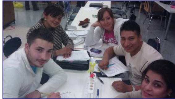
Dorothy Stang High School students will receive a their diplomas upon completion of the program.

Thus, Casa Juan Diego has a full house: parents and small children learning in the mornings with Tolton, students in after-school being academically tutored and learning dance, art and music through Casa Juan Diego, and adults studying in the evenings for their Dorothy Stang high school diploma. Thanks be to God for these partners.