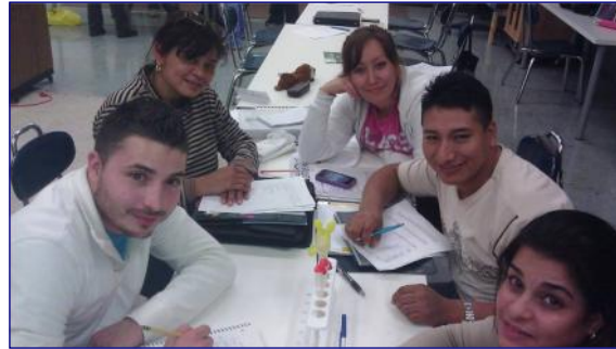
Dorothy Stang High School students will receive a their diplomas upon completion of the program.

Thus, Casa Juan Diego has a full house: parents and small children learning in the mornings with Tolton, students in after-school being academically tutored and learning dance, art and music through Casa Juan Diego, and adults studying in the evenings for their Dorothy Stang high school diploma. Thanks be to God for these partners.