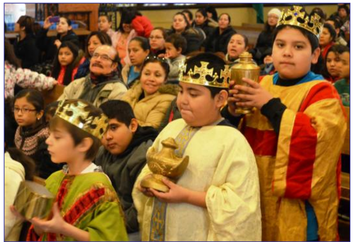
Families watch as the Three Kings present their gifts during the religious education program's annual "Tres Reyes" celebration.