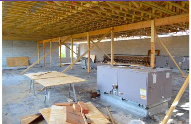
The new HVAC system is installed in the new second story of Casa Juan Diego Youth Center at 2020 Blue Island. An elevator will make the building accessible.

Meanwhile our after-school and other programs continue to thrive in our temporary site at the former Holy Trinity School a few blocks east of the parish. More than 75 children have signed up to enjoy summer sports, cultural activities, and academic support.